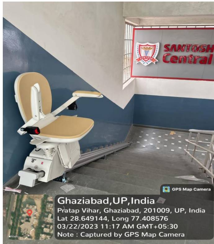
Stairs Lift for person with Disabilities