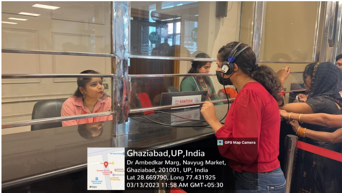
Assistive Technology for Hearing